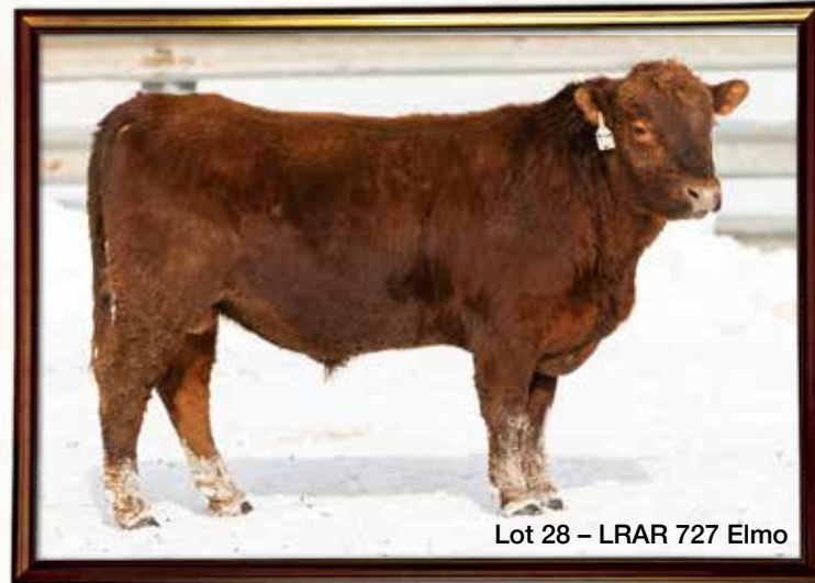
Lot 28 - LRAR 727 Elmo

Stop frame creep with this bull made for calving ease. Excellent all-around EPDs make this bull's future bright.