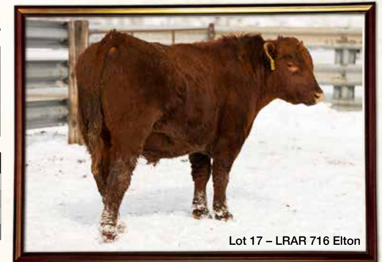
Lot 17 - LRAR 716 Elton