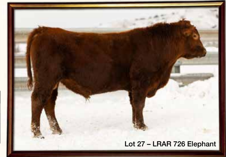
Lot 27 - LRAR 726 Elephant

Thank you for your interest! We are excited to show you what our Bulls can bring to your herd.