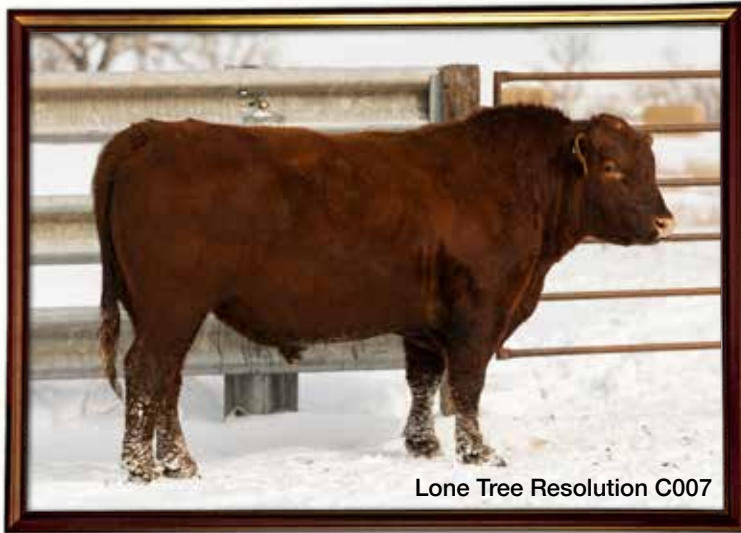
Lone Tree Resolution C007