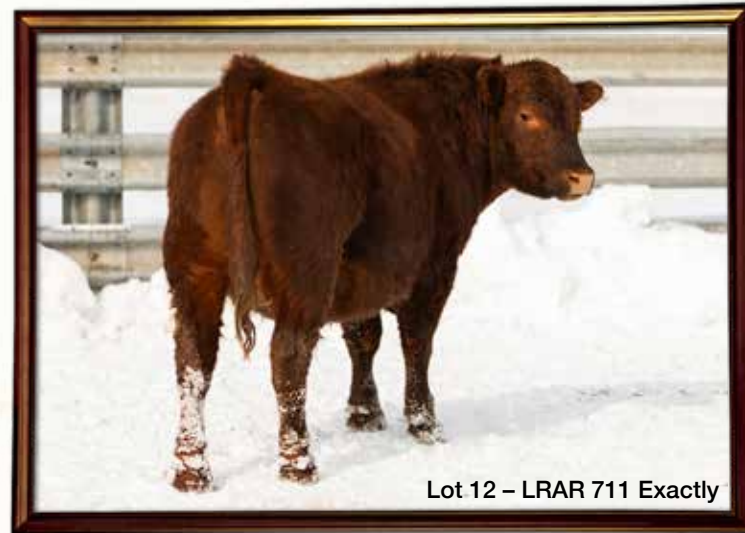
Lot 12 - LRAR 711 Exactly

This bull is deep bodied with a lot of natural thickness. His dam is a favorite. She holds her body condition throughout the year. She combines thickness, femininity and a great disposition into one package.