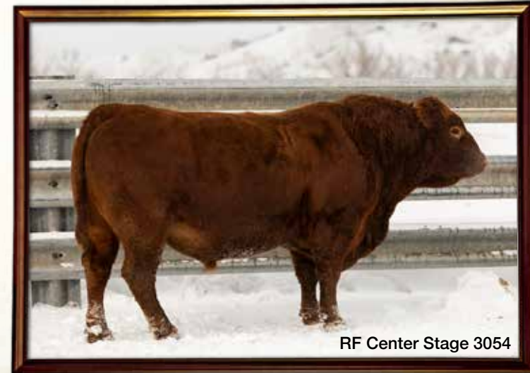
RF Center Stage 3054