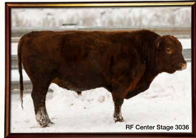
RF Center Stage 3036