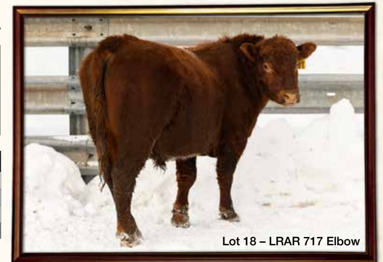
Lot 18 - LRAR 717 Elbow