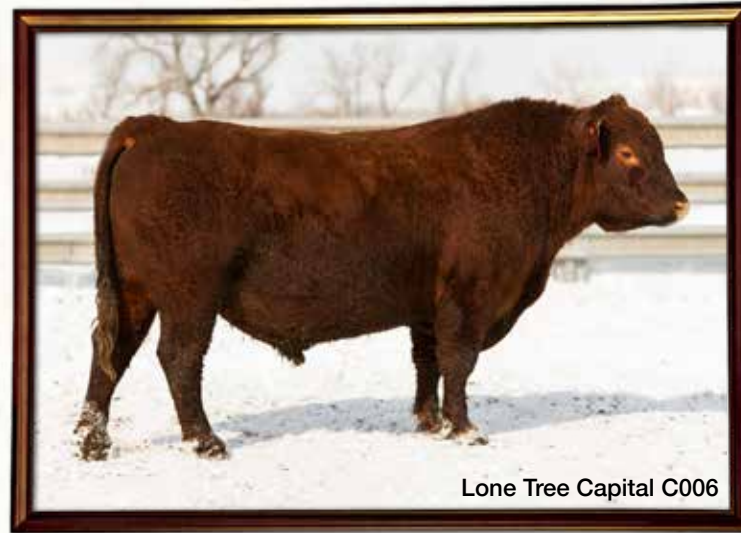
Lone Tree Capital C006