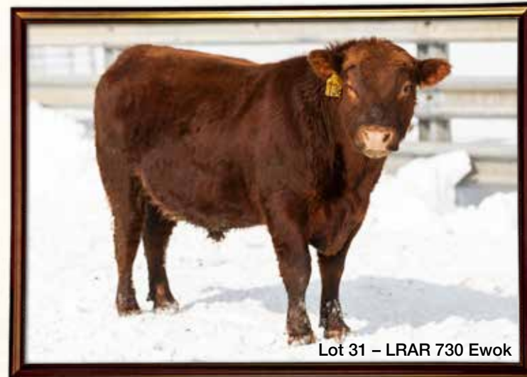
Lot 31 - LRAR 730 Ewok