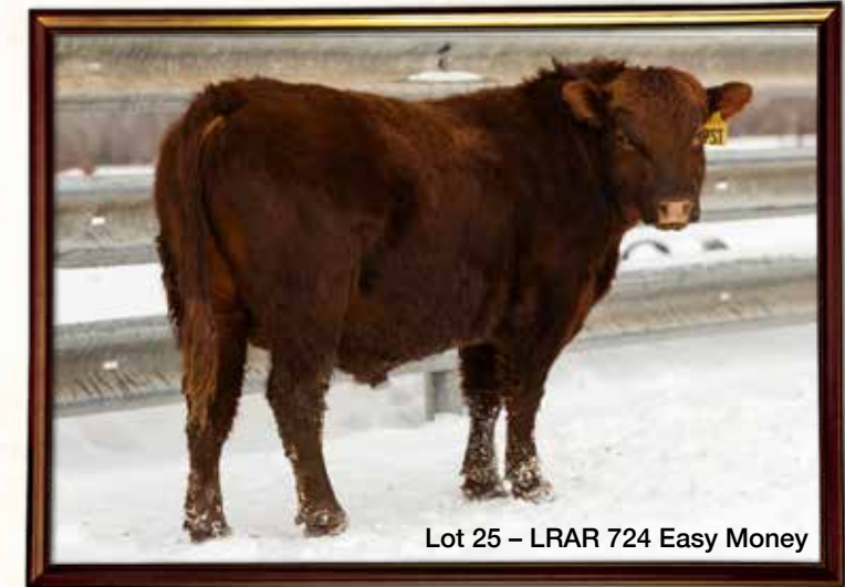
Lot 25 - LRAR 724 Easy Money

Thank you for your interest! We are excited to show you what our Bulls can bring to your herd.